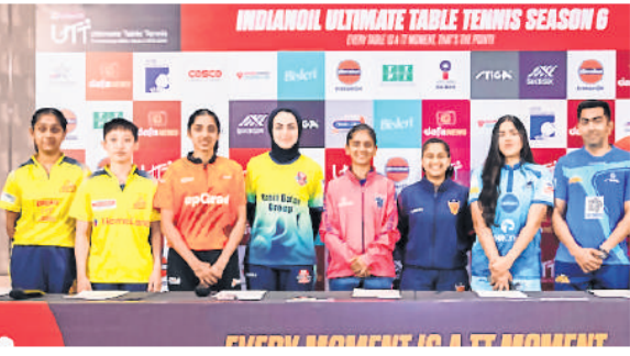
UTT season 6 begins in Ahmedabad on Saturday.

"I was in the stands watching the action very keenly when the first season of UTT